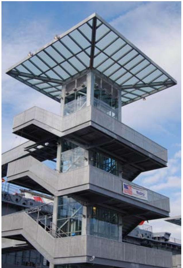
USS Intrepid Gangway New York