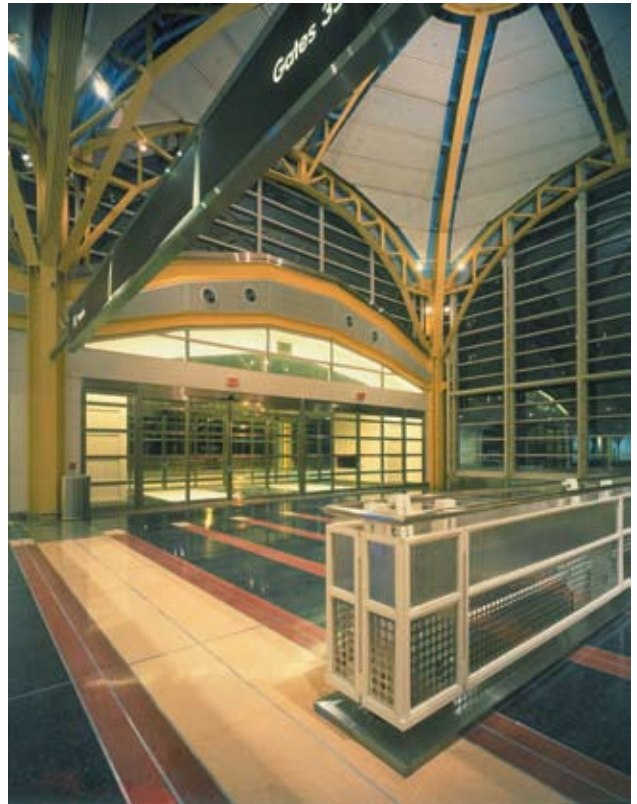
Security Screening Reagan Airport