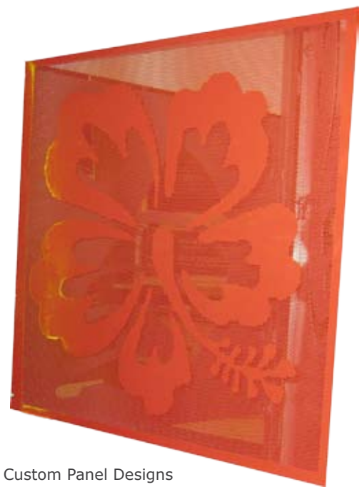
Custom Panel Designs

At Hendrick Manufacturing our focus is customer service. We design and produce perforated metal products to your specifications, provide a quick quote, response, and prompt delivery. We've been a leader in the perforated metal industry since 1876