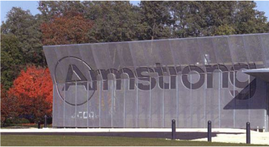
Armstrong Visitor Center Custom Signage