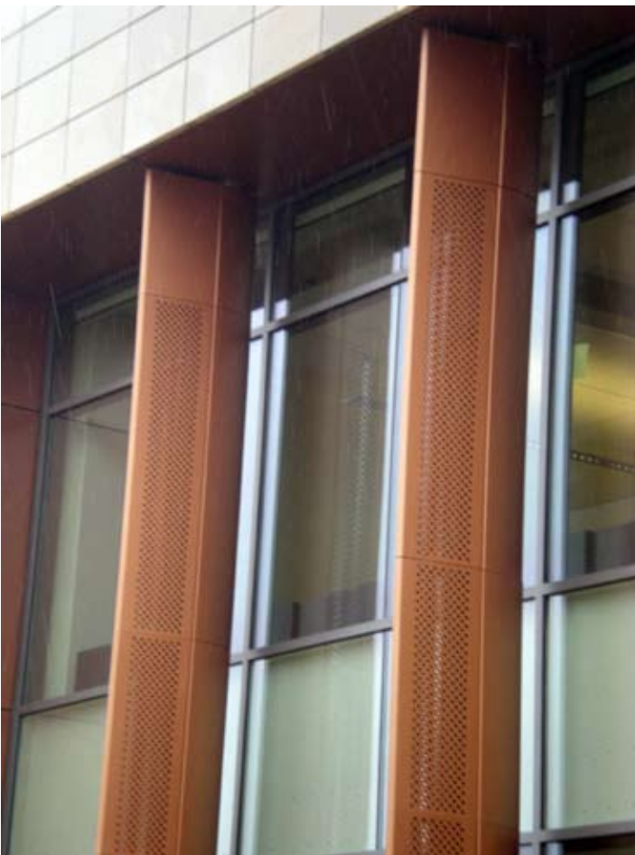
Johnson Controls Glendale Wisconsin Custom Column Covers

At Hendrick Manufacturing our focus is customer service. We design and produce perforated metal products to your specifications, provide a quick quote, response, and prompt delivery. We've been a leader in the perforated metal industry since 1876