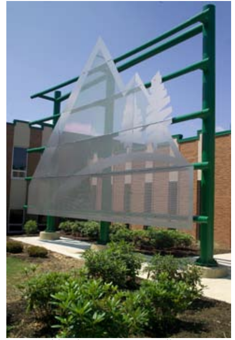
Penn Highlands Community College