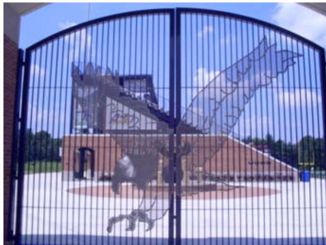
Ashland University Mascot Sign